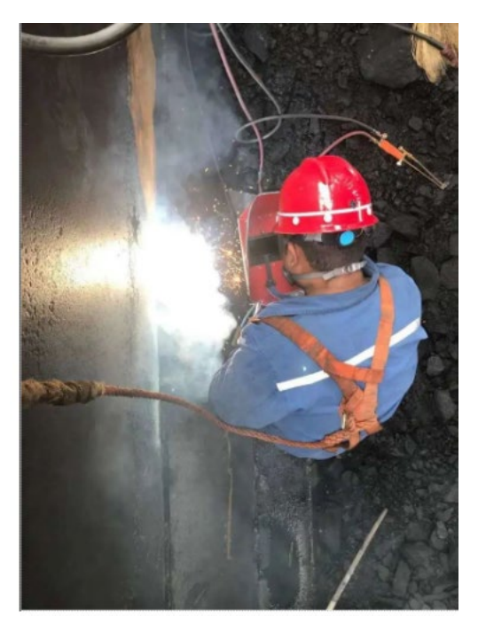
A photograph in a Xinjiang Energy (Group) publication from August 2020 shows what it says is a labor transfer worker welding at a company coal mine. Xinjiang Energy (Group) supplies coal to Xinjiang's aluminum industry.

The positive portrayal of Uyghur workers in company, government, and media reports downplays the Chinese government's abusive treatment of Uyghurs in Xinjiang, as well as evidence of coercion in the labor transfer program itself. The government's restrictions on access to Xinjiang, as well as the risk of reprisals against workers that speak to independent auditors, make it