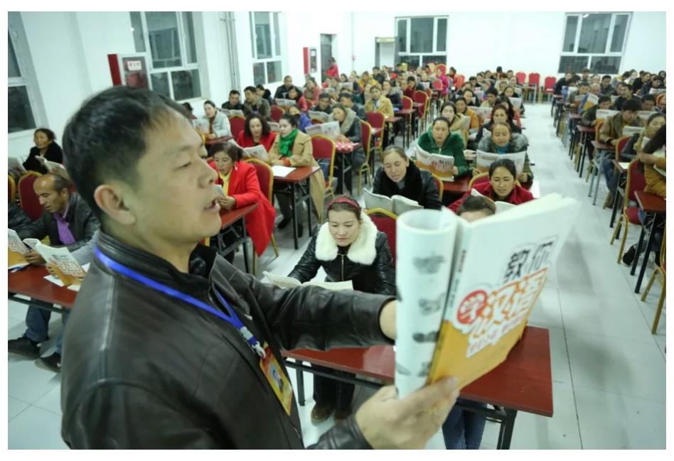
A teacher trains Turkic Muslims in Mandarin Chinese. The photograph is featured in a February 2023 article on government officials' promotion of labor transfers in Xinjiang.

East Hope Group stated on its website in March 2020 that Xinjiang East Hope Nonferrous Metals had "received 235 ethnic minority employees from southern Xinjiang," including in its electrolytic aluminum department.<sup>114</sup> The website also stated that the company has "actively absorbed the surplus labor force from southern Xinjiang to transfer employment, effectively solving the employment and living pressure of ethnic minorities." The article also described the training received by ethnic minority workers, including efforts to teach them Mandarin Chinese and address perceived problems in education levels: