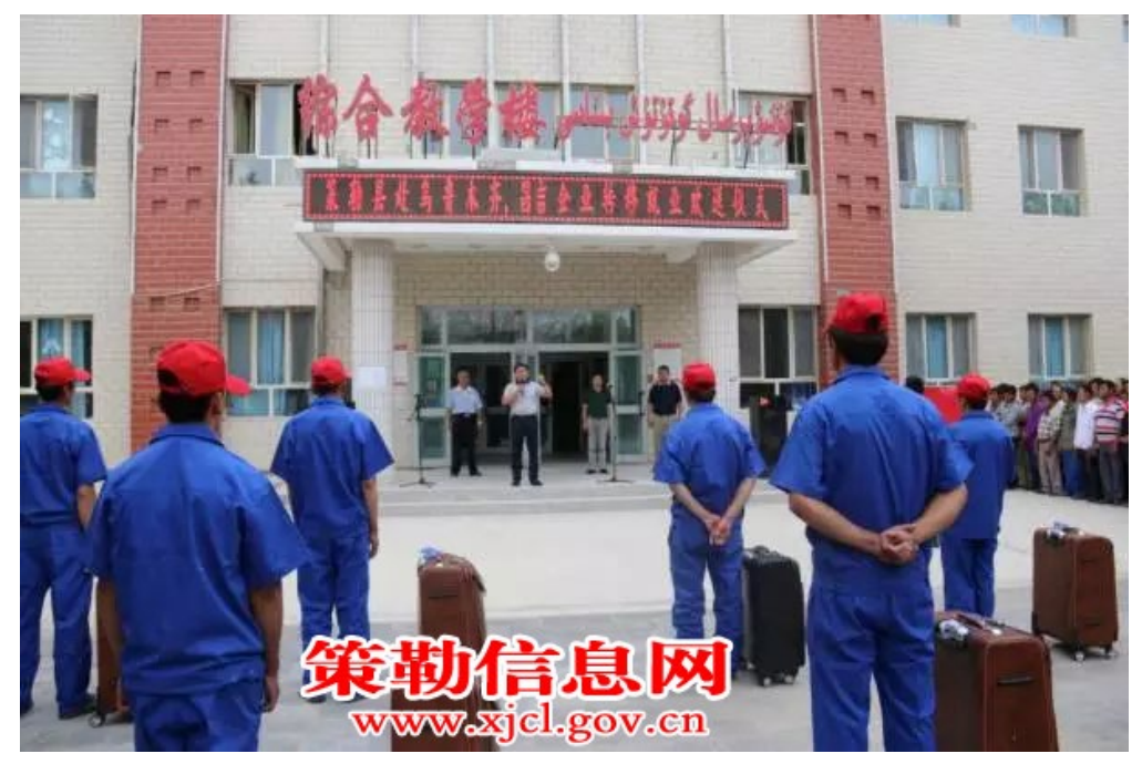
Photo of a local government ceremony in June 2017 shared by the People's Government of Qira County to mark the departure of labor transfer workers from Qira County to companies in Urumqi and Changji. The article accompanying the photo includes a description of transfers to Xinjiang East Hope Nonferrous Metals, a Xinjiang-based aluminum producer.

Company and media reports also provide evidence of links between smaller Xinjiang-based aluminum smelters and labor transfers. For example, a 2017 article cited by Horizon Advisory described labor transfers involving Xinjiang Tianlong Mining, which operates a smelter producing approximately 250,000 tons of aluminum per year. The article stated that surplus laborers from southern Xinjiang have "started their new life" in Fukang, where Xinjiang Tianlong's smelter is located. The article then describes efforts by Fukang Xinjiang Tianlong Mining to teach Chinese to newly arrived workers, who all have Uyghur names: