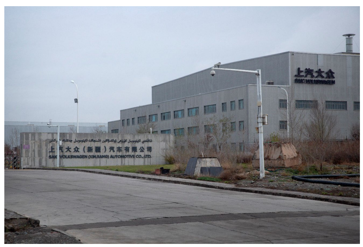
A plant operated by a subsidiary of SAIC-Volkswagen on the outskirts of Urumqi, the capital of China's Xinjiang Uyghur Autonomous Region, on April 22, 2021.

Volkswagen released a summary of the results of the audit, but not the audit report, on December 5, 2023.<sup>293</sup> The audit found "no indications of any use of forced labor or forced laborers among the employees at the plant of the audited legal entity."<sup>294</sup> The audit was overseen by Markus Löning, Germany's former Commissioner for Human Rights, with the actual audit conducted by a Shenzhen law firm.<sup>295</sup>