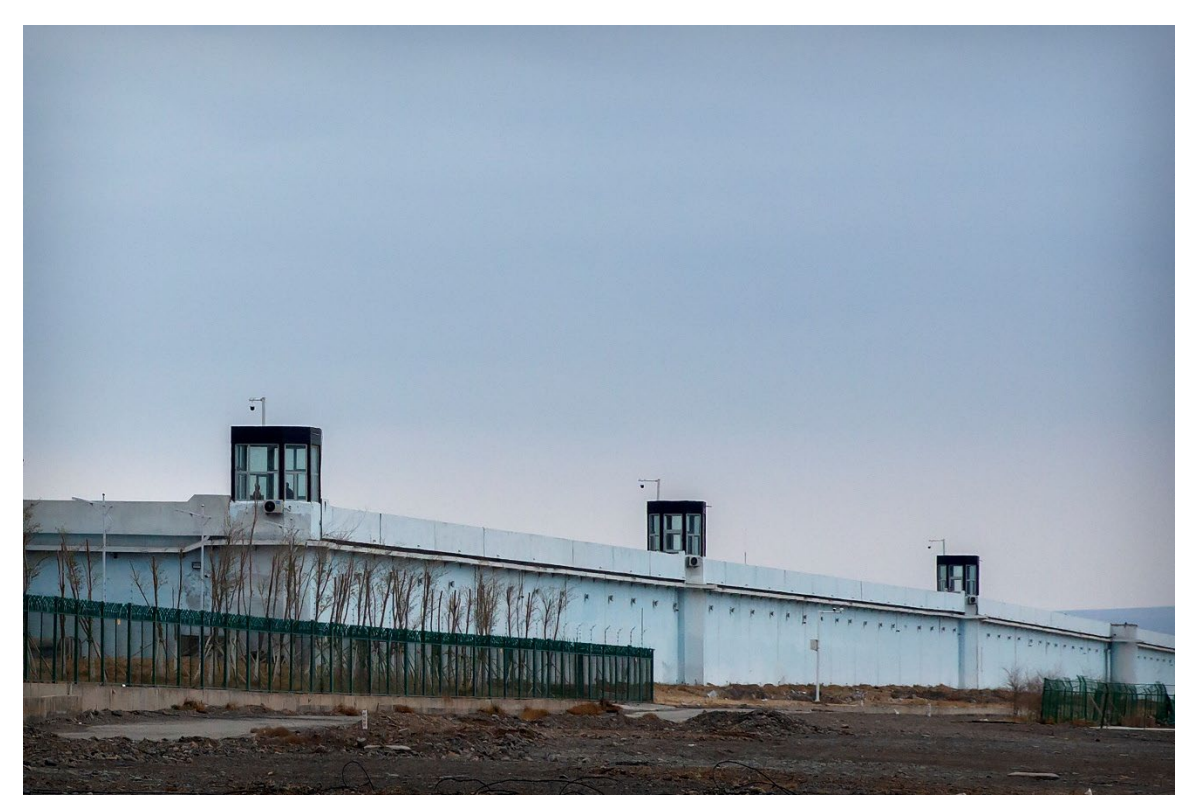
A guard stands in a tower on the perimeter of the Number 3 Detention Center in Dabancheng in Xinjiang Uyghur Autonomous Region on April 23, 2021.

The Chinese government's violations in Xinjiang show no sign of abating.<sup>20</sup> The Xinjiang Communist Party secretary, Ma Xingrui, vowed in November 2022 to continue "counterterrorism and stability maintenance" measures, require "various ethnic groups ... to fully embed" into the Chinese nation, "Sinicize" Islam so it is consistent with "socialist values," and deepen cultural and ideological control over the region.<sup>21</sup> Although some "political re-education" camps appear closed, there has been no mass release from prisons, where a half million Turkic Muslims have been held since the start of the